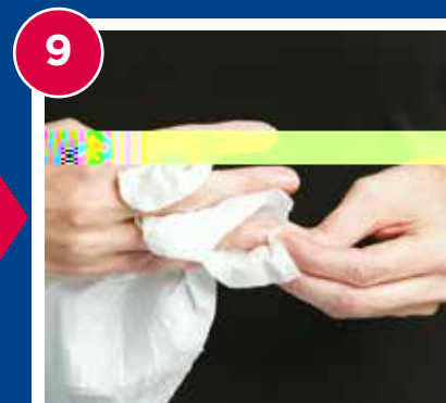
Dry palms and backs of hands using a paper towel to help remove remaining bacteria